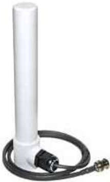
Figure 4 iANT100 Ex e Antenna

A further issue with this method of protection is that the access point only directs RF power from the front of the enclosure (not in the case of glass dome Ex d enclosures), which will limit the flexibility of the device and also cause RF shadows in the close proximity of the unit. RF multi-path interference can also be created at higher frequencies which is an effect to be avoided in deployments. However, although this method has its failings, it is reasonably cost effective and the Ex certification is relatively simple, so it does have its place provided that the application suits the RF shortcomings.