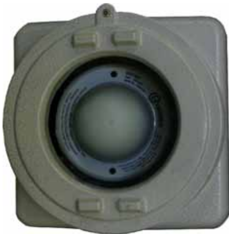
Figure 3 Antenna in Ex d enclosure with window

this case, transmitting data). Some still do today. This is quite suitable for applications at lower frequencies but not ideal for higher frequencies such as 2.4 and 5GHz WLAN as the glass highly attenuates the signal and, with a typical output of only c.100mW from the device in the case of an 802.11b/g/n WLAN, this is a far from ideal solution.