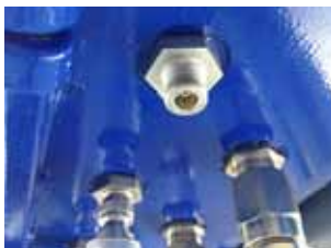
Figure 8 - iSOLATE CT connector transit on Exd enclosure

Another real advantage of intrinsically safe circuits is that they can be worked on "live" without them needing to be isolated as there is no concern of ignition. This means that standard RF connectors and cabling can be used which also simplifies deployment in the field. The apparatus certified iSOLATE-CT RF connector transit means that a conventional type N RF connector is present on the outside of the Exd enclosure for connection to the antenna. This completely eliminates the need use a cable gland to connect to the RF output of the transceiver inside the Exd enclosure and means that installation is a much quicker and simplified process.