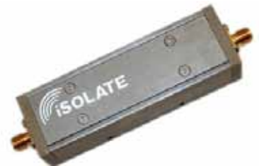
Figure 7 - iSOLATE500 intrinsically safe galvanic RF isolator

A recent development by Extronics has completely altered the landscape of deploying wireless networks in hazardous areas by using the intrinsic safety protection concept and being able to deploy wireless hardware e.g. access points and standard antennas, without further Notified Body certification. The iSOLATE500 is an "associated apparatus" certified RF galvanic isolator and, just like a conventional zener barrier or galvanic isolator for analogue or discrete signals e.g. 4-20mA and volt free contacts, they can be deployed by the user without further certification by a Notified Body. The only requirement is that the conditions stipulated on the certificate are followed and the general rules of verifying intrinsically safe circuits are applied.