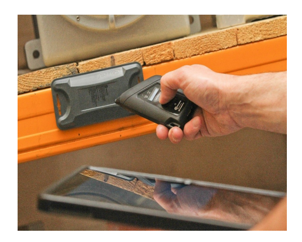
Figure 3: A UHF RFID tag being read

This electromagnetic energy may come from a tag reader designed to activate the tags, either handheld or fixed. Equally, that electromagnetic energy could come from an undisclosed source in the environment – for example, created by nearby electrical sources, machinery, or processes.