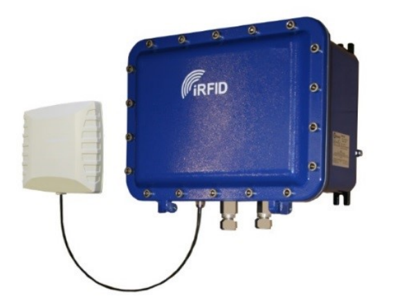
Figure 6: Example of a wall mounted RFID reader

A tag positioned within such an electromagnetic field (such as a tag left near to a continuously operating wall mounted reader) could have a large amount of energy induced into its circuits. Without being tested and certified, there is no way to ensure that the tag cannot produce a spark through stored energy or become hot enough that it could ignite a potentially explosive atmosphere.