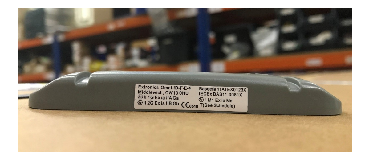
Figure 8: Close up view of iTAG500 hazardous area markings

However, if you choose to use certified RFID tags, that responsibility lies with the supplier / manufacturer. The end user has no liability or need to carry out batch quality control.