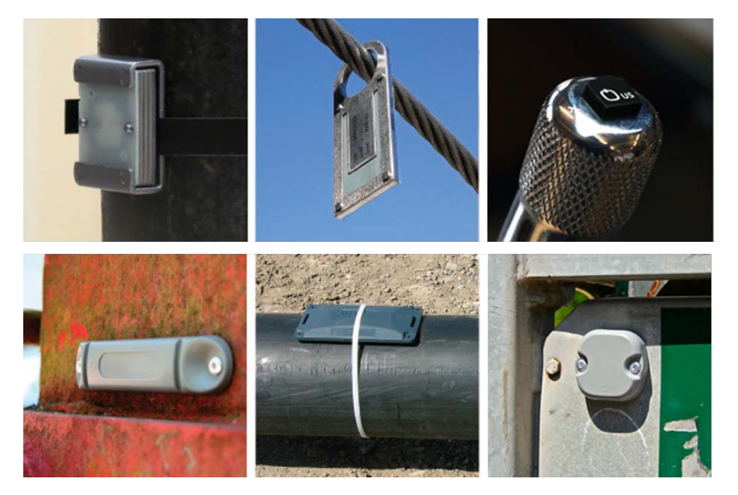
Figure 2: Examples of UHF RFID tags